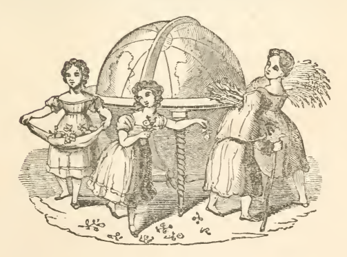
NEW YORK: HARPER & BROTHERS, PUBLISHERS, 82 CLIFF STREET.